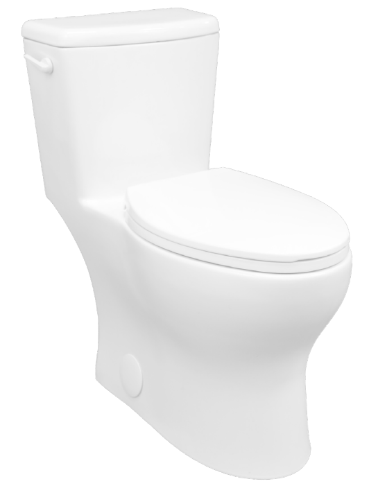
*Seat not included