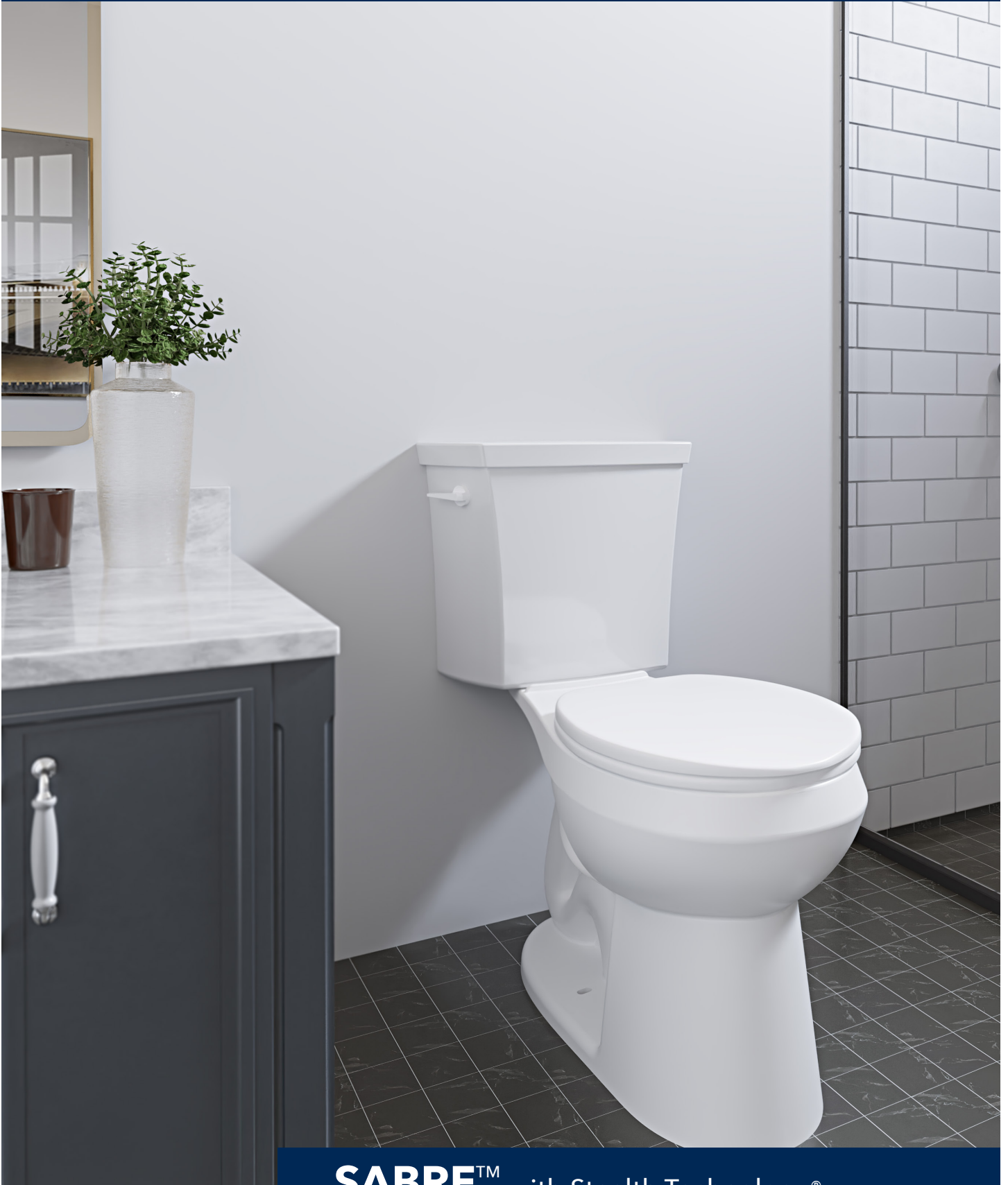
SABRE™ with Stealth Technology® 1.1 GPF Single Flush Toilet Round Bowl with 10" Rough-in